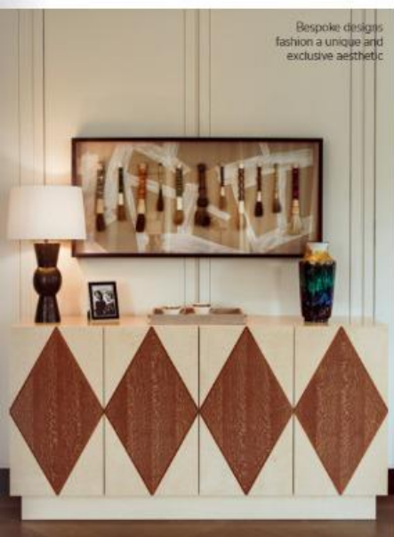
Bespoke designs fashion a unique and exclusive aesthetic