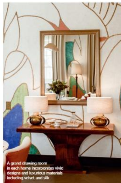
A grand drawing room in each home incorporates vivid designs and luxurious materials including velvet and silk