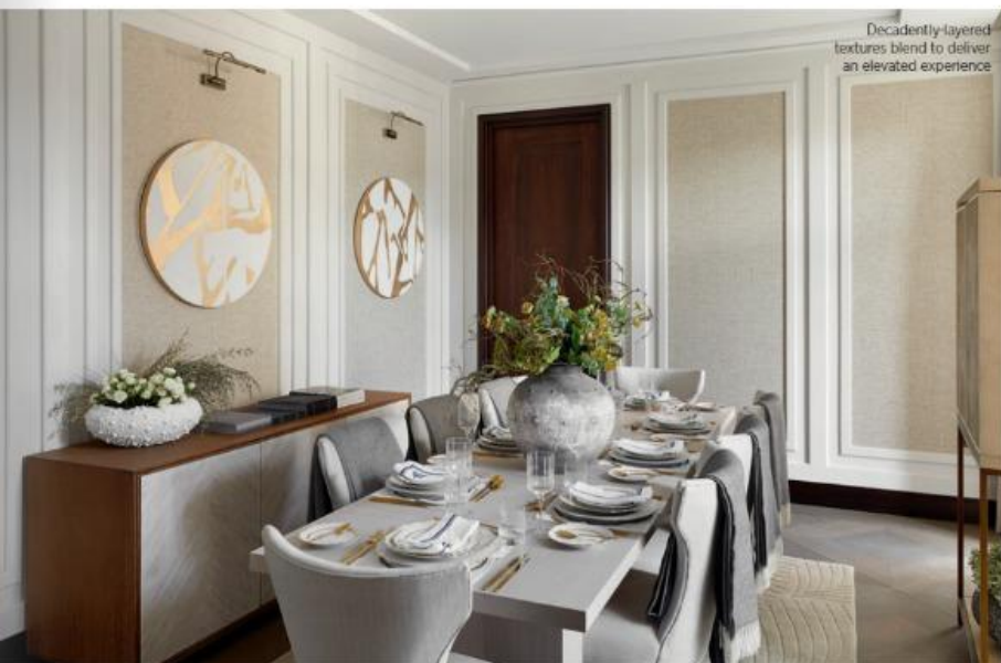
Decadently-layered textures blend to deliver an elevated experience

No. 1 Grosvenor Square is something of an anomaly. Such a rare piece of London real estate in a central location with prestige and history, but inside it's designed for the present with the finest services, future-proof technology and distinctive design. ■ 1gsq.com