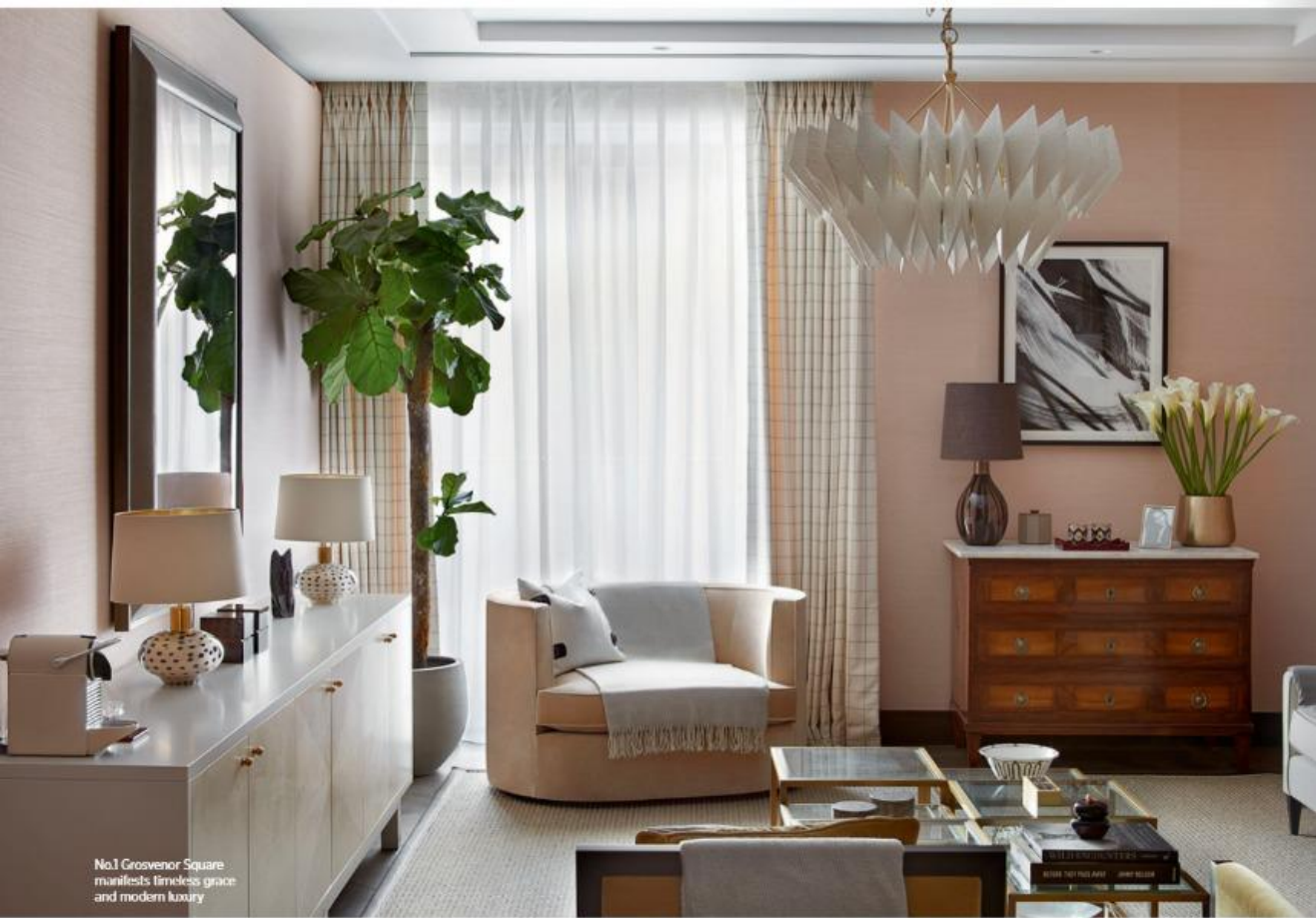
No.1 Grosvenor Square manifests timeless grace and modern luxury

Elegant proportions, grand ceilings and entirely bespoke design come together at No.1 Grosvenor Square